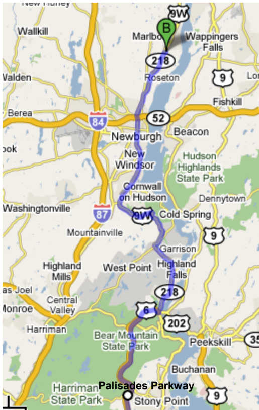
Via Palisades Parkway and Route 9W